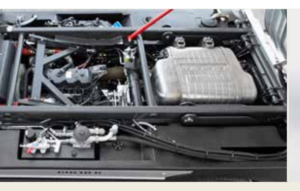
Low-emission Engine Euro 6 The smoothrunning, high-torque Iveco Euro 6 diesel engine with extremely low fuel consumption and emission levels allows exceptionally reliable and economical operation.